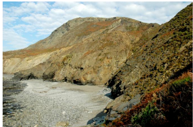
A sandy and stony beach dominated by High Cliff

Adjacent to the towering High Cliff, Rusey Beach has a dramatic setting and in this respect is similar to The Strangles, about 1km to the north. It faces west but has a degree of shelter from the headland and Rusey Cliff immediately to the south. Access is not that easy but the lengthy decent to the beach is well worth it when the beach is finally reached.