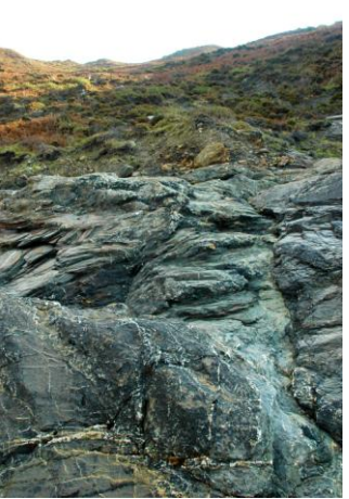
Stony path down the cliff